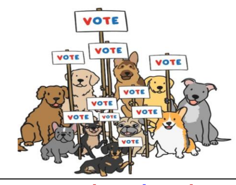
VOTE! VOTE! VOTE! Vote for your favorite pet in each category. VOTING ENDS AT NOON ON THURSDAY!

<u>The entry fee is $1.00</u> (paid to English teacher) Winners from English classes will advance to the Semi-Finals and Finals to take place during lunch on Thursday, April 25. <u>The winner will</u> <u>receive a TROPHY</u>! WILL YOU BE THE CHAMPION?